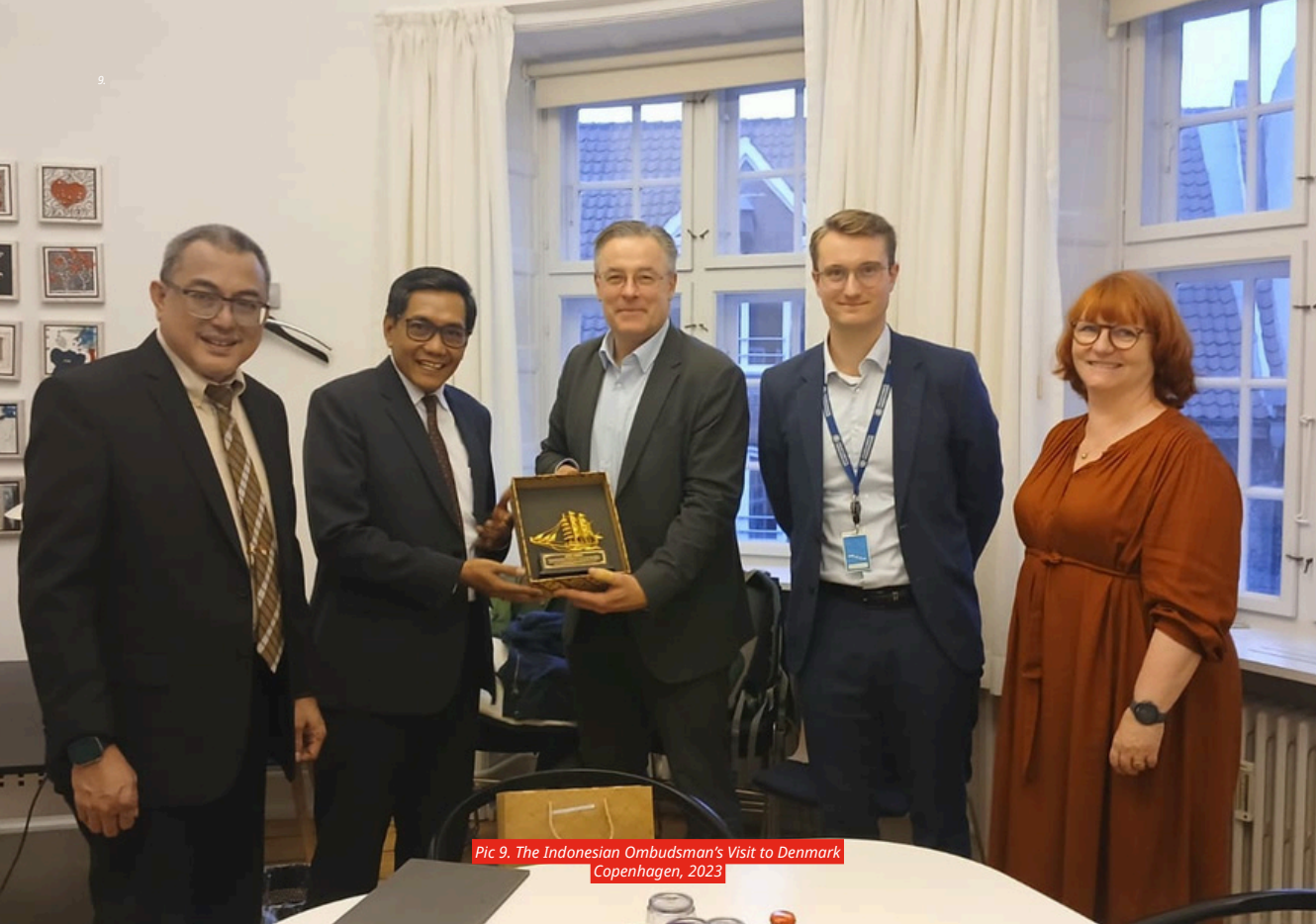
Pic 9. The Indonesian Ombudsman's Visit to Denmark Copenhagen, 2023