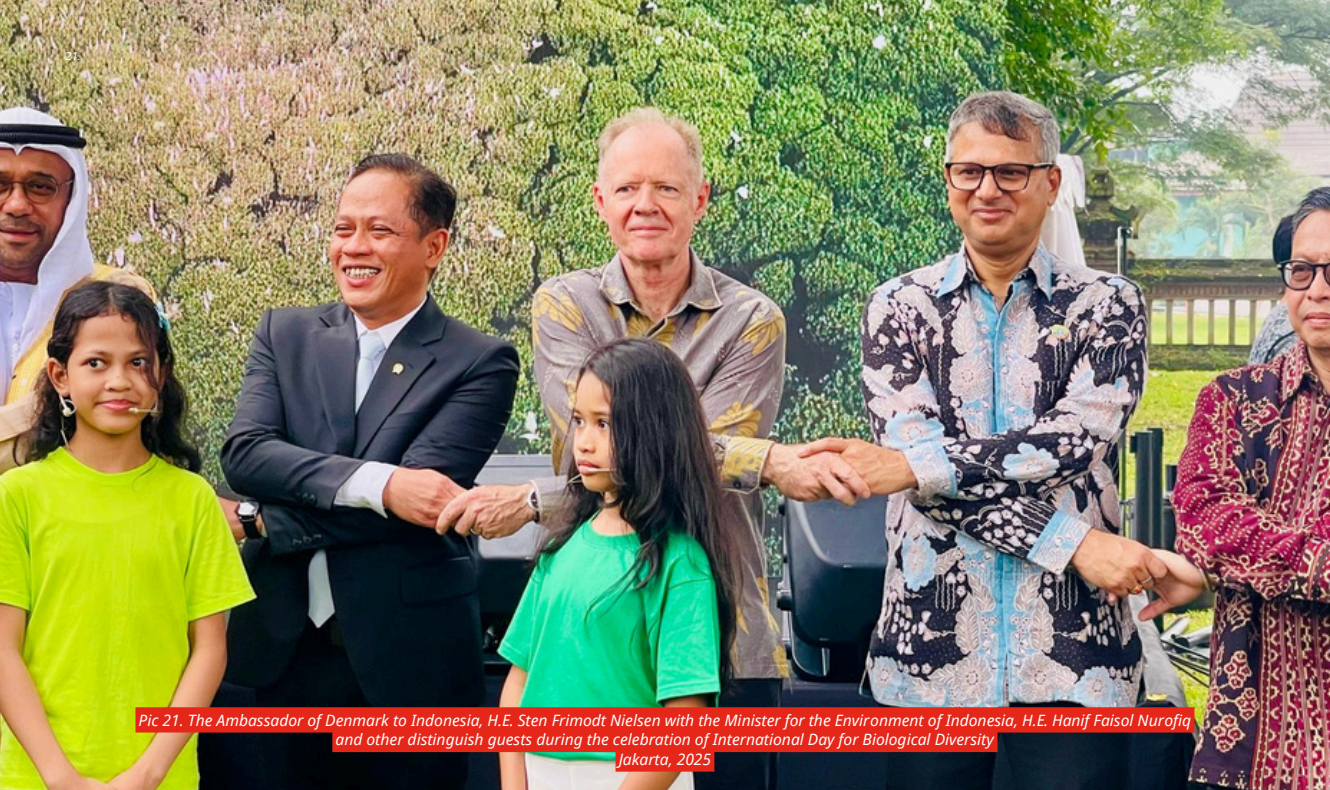
Pic 21. The Ambassador of Denmark to Indonesia, H.E. Sten Frimodt Nielsen with the Minister for the Environment of Indonesia, H.E. Hanif Faisol Nurofiq and other distinguish guests during the celebration of International Day for Biological Diversity Jakarta, 2025