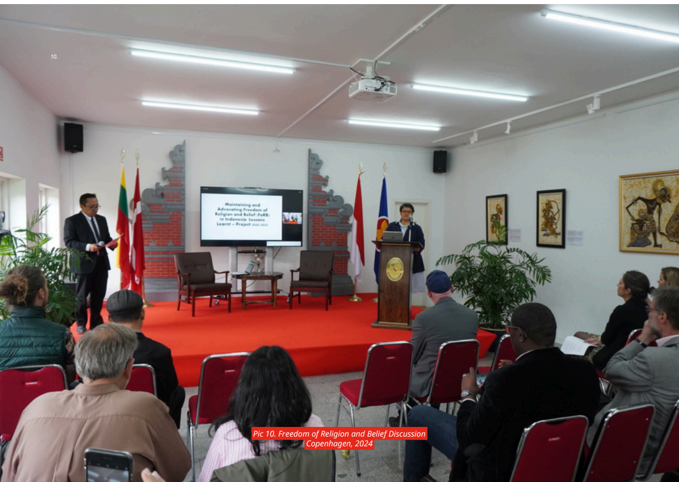
Pic 10. Freedom of Religion and Belief Discussion Copenhagen, 2024