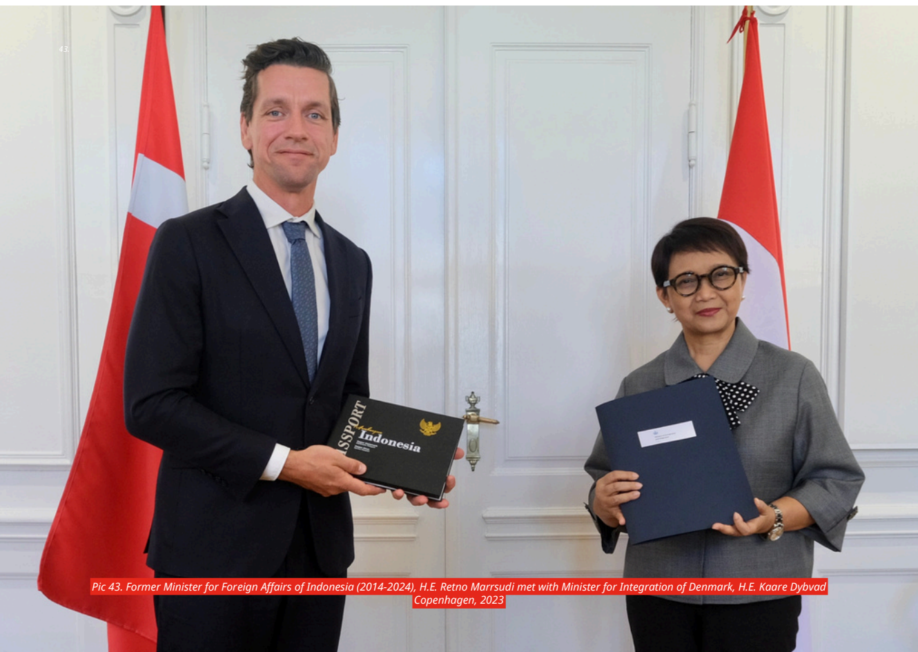
Pic 43. Former Minister for Foreign Affairs of Indonesia (2014-2024), H.E. Retno Marsudi met with Minister for Integration of Denmark, H.E. Kaare Dybvad Copenhagen, 2023