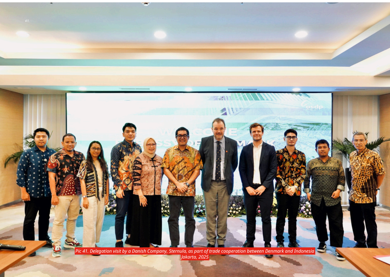
Pic 41. Delegation visit by a Danish Company, Sternula, as part of trade cooperation between Denmark and Indonesia Jakarta, 2025