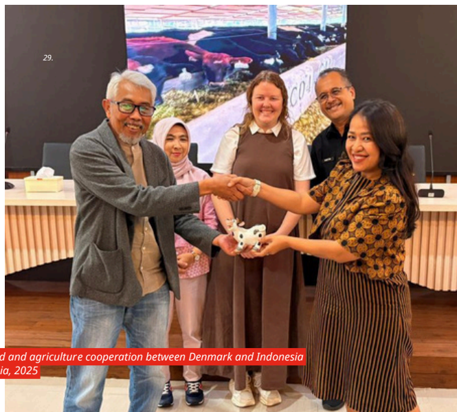
Pic 25-29. Indolivestock event and delegation visit as part of food and agriculture cooperation between Denmark and Indonesia, 2025