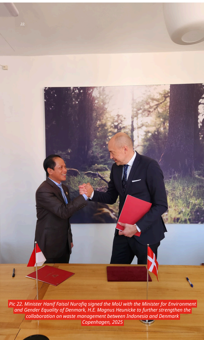
Pic 22. Minister Hanif Faisol Nurofiq signed the MoU with the Minister for Environment and Gender Equality of Denmark, H.E. Magnus Heunicke to further strengthen the collaboration on waste management between Indonesia and Denmark Copenhagen, 2025