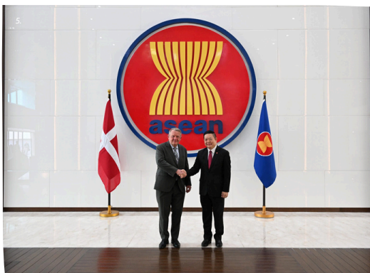
Pic 5. Minister for Foreign Affairs of Denmark, H.E. Lars Løkke Rasmussen, met with the Secretary-General of ASEAN, H.E. Dr. Kao Kim Hourn Jakarta, 2025