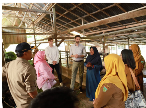
Pic 30-31. Field visit for dairy sector, part of food and agriculture cooperation between Denmark and Indonesia Padang, 2025