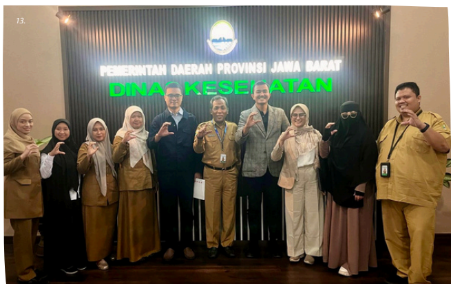
Pic 12-13.Exploring digital healthcare opportunities and public-private partnership as part of the health cooperation between Denmark and Indonesia (Copenhagen & Bandung, 2025)