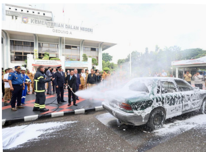
Pic 11. Minister for Home Affairs of Indonesia, H.E. Tito Karnavian, during a live Presentation for Safety Fire Handling by a Danish company, Firexpress, at the Ministry of Home Affairs of Indonesia Jakarta, 2025