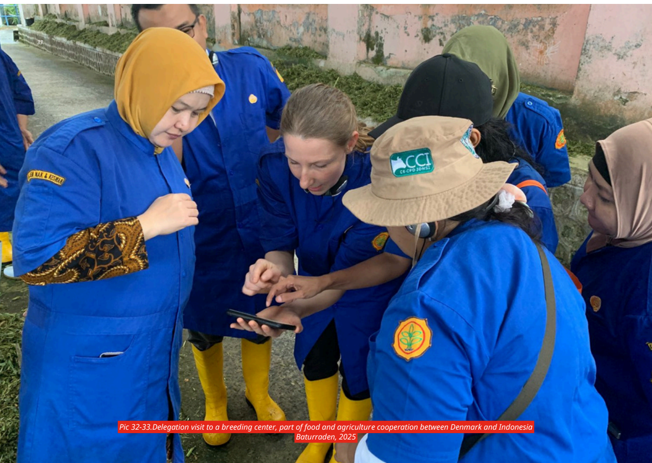
Pic 32-33. Delegation visit to a breeding center, part of food and agriculture cooperation between Denmark and Indonesia Baturraden, 2025