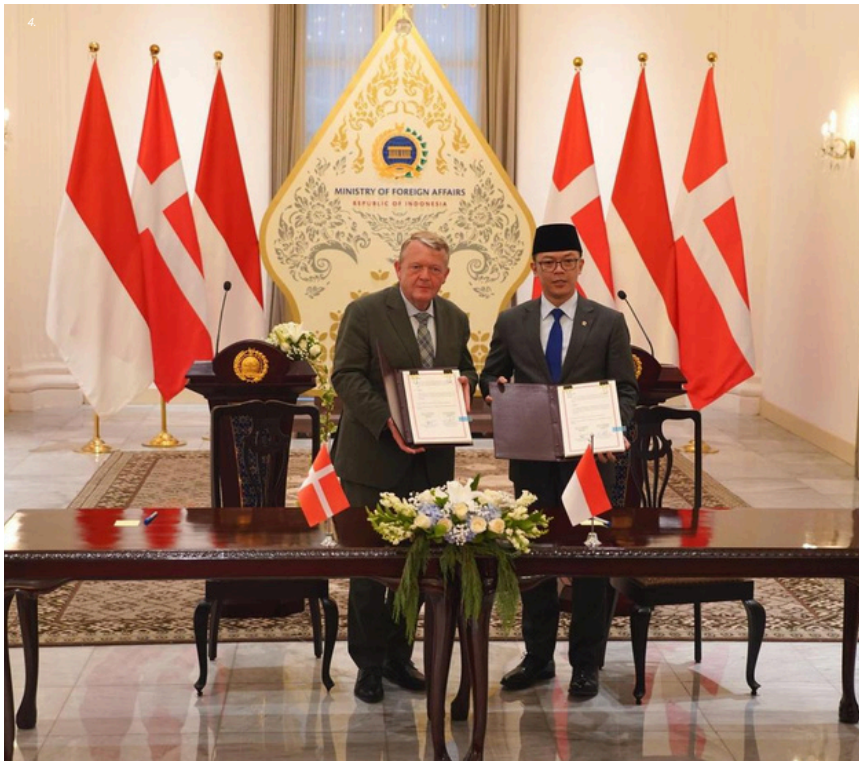
Pic 1-4. Minister for Foreign Affairs of Denmark, H.E. Lars Løkke Rasmussen, and Minister for Foreign Affairs of Indonesia, H.E. Sugiono, signed the new Indonesia-Denmark Plan of Action 2025-2029 Jakarta, 2025