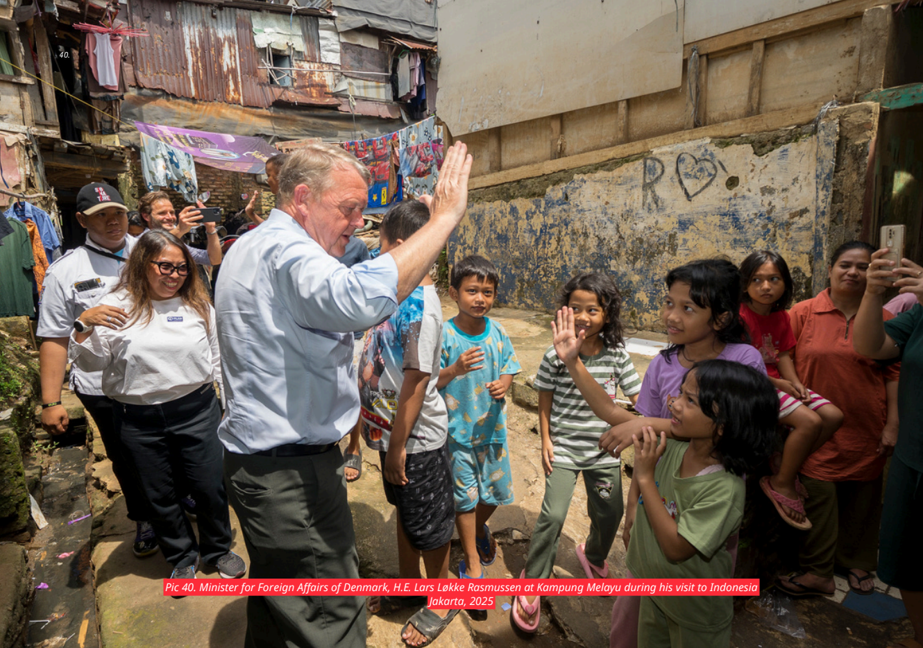
Pic 40. Minister for Foreign Affairs of Denmark, H.E. Lars Løkke Rasmussen at Kampung Melayu during his visit to Indonesia Jakarta, 2025