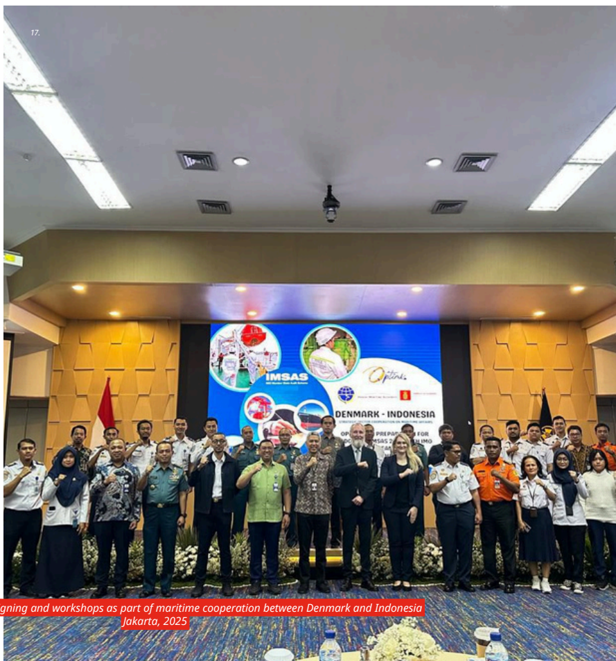
Pic 15-17. Agreement signing and workshops as part of maritime cooperation between Denmark and Indonesia Jakarta, 2025