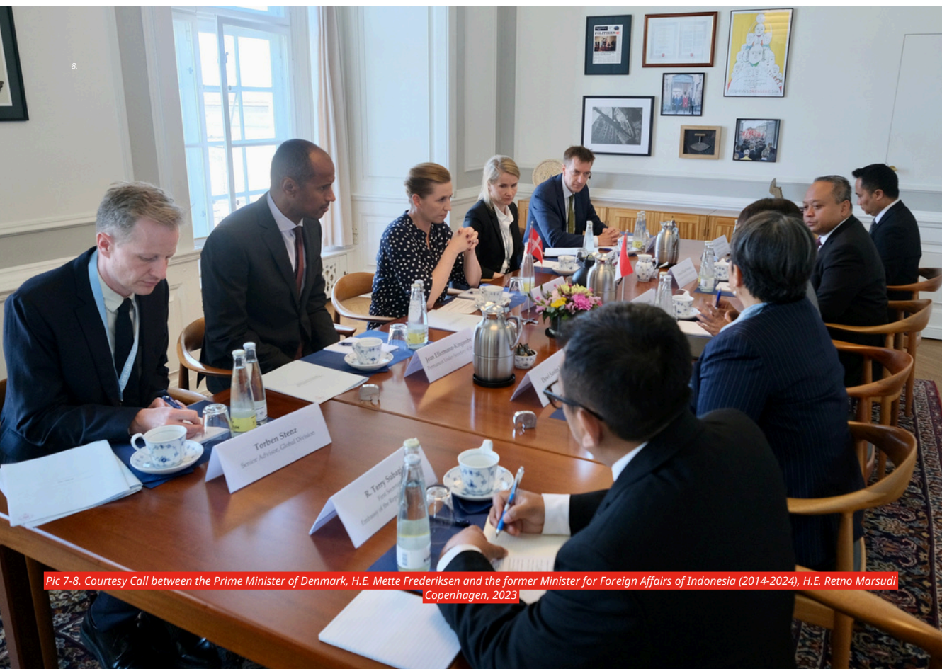
Pic 7-8. Courtesy Call between the Prime Minister of Denmark, H.E. Mette Frederiksen and the former Minister for Foreign Affairs of Indonesia (2014-2024), H.E. Retno Marsudi Copenhagen, 2023