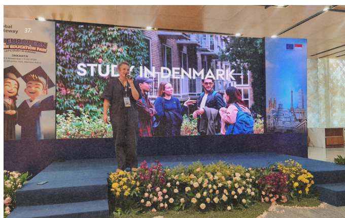
Pic 37. Promoting Study in Denmark during the European Higher Education Fair (EHEF) Jakarta, 2024