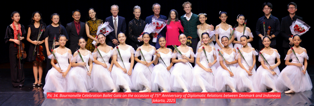
Pic 34. Bournonville Celebration Ballet Gala on the occasion of 75 th Anniversary of Diplomatic Relations between Denmark and Indonesia Jakarta, 2025