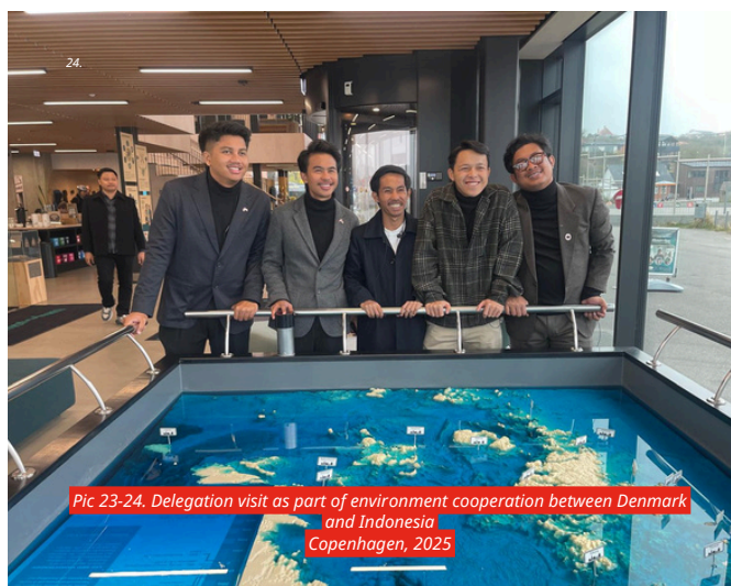
Pic 23-24. Delegation visit as part of environment cooperation between Denmark and Indonesia Copenhagen, 2025